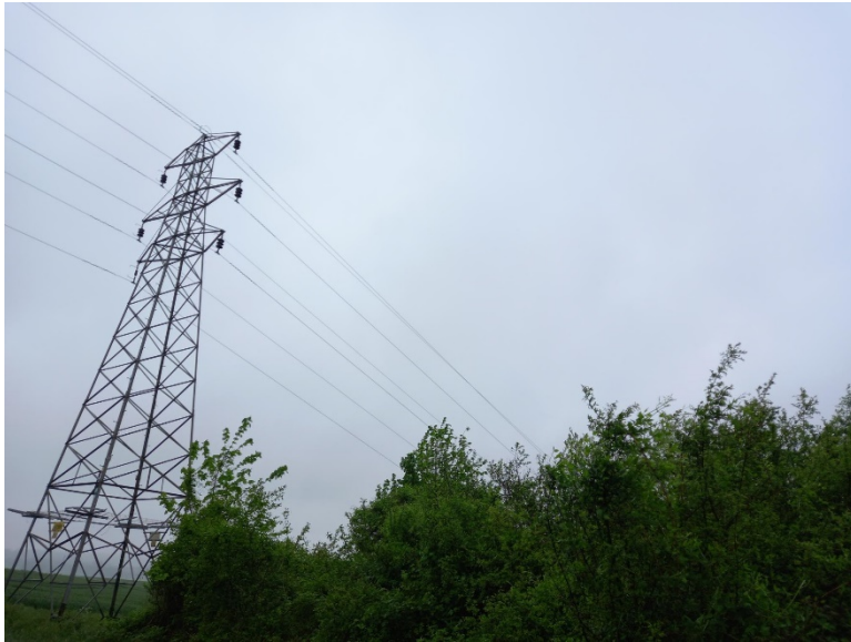
View from the path