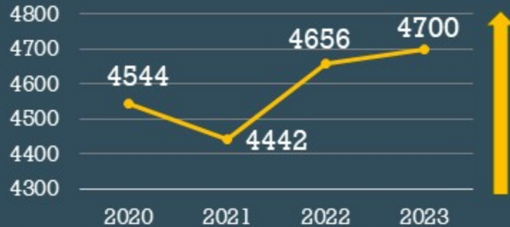
HOURS WORKED PER YEAR 2020-2023

* Please note that statistics displayed are gathered from information recorded by staff at Salisbury CityWatch and have no connection to data from any other organisations.