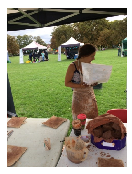
Preparing for a busy 'Picnic in the Park'

Working with the Salisbury City Council Community Development Team, the museum attends community events across the city including the summer 'Community on Tour' events in Bemerton, Bishopdown and Harnham as well as the County led events such as 'Picnic in the Park'. Freelance artists devise and lead the workshops which included gargoyle making, block printing and lantern making. In the summer of 2018 we made 605 craft objects with visitors at the five events we attended.