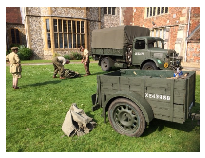
WWII 'Dorset regiment' May half term 2018

On Tuesdays of every holiday we have special events for families. This includes Easter, February half term, spring half term and Tuesdays across the summer. The theme and content are never the same. For example over the late May bank holiday we welcomed the Andover-based living history group 'Britain at its Best'. This group brings to life exactly what a field office of the 4th Battalion Dorsetshire regiment would have been like during World War II.