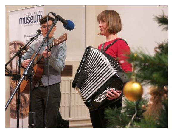
Christmas cheer at the museum