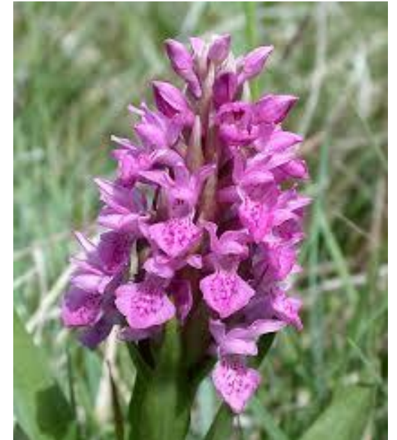
Dactylorhiza incarnata a marsh-orchid

Lost from many sites in Wiltshire, Broken Bridges has a rare subspecies which needs to be protected.