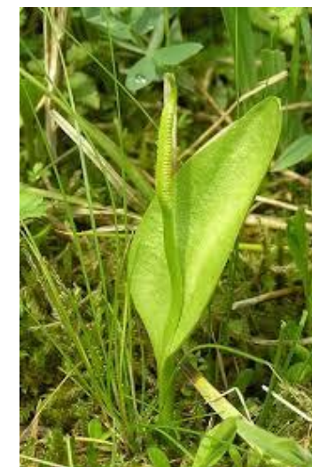
Abundant in 2009, none found in 2024