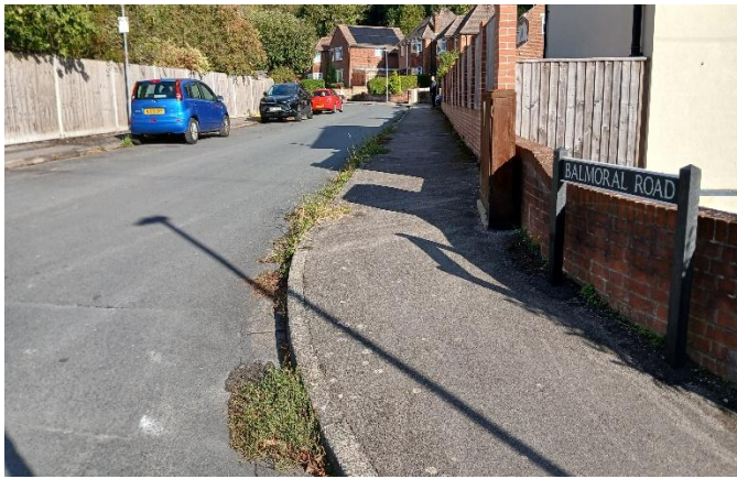
Image Three view of proposed location of bus stop (facing Thistlebarrow Road) showing proposed location on right of the road.

Have you been in touch with your local Wiltshire Councillor?