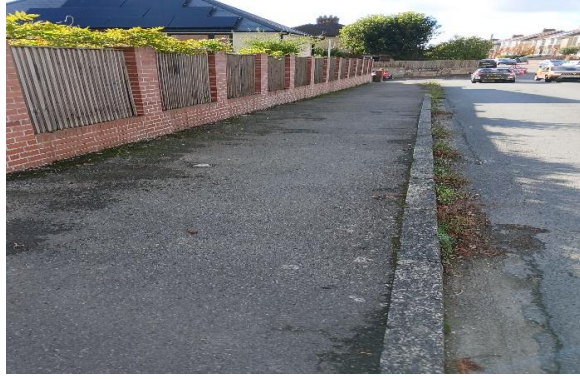
Image Two proposed location of bus stop at the end of Balmoral Road heading towards Bartlett Road.