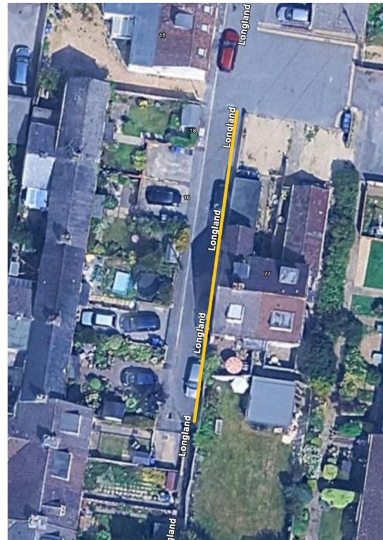
Requested location of double yellow lines