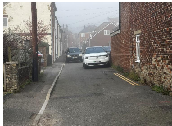
View of current double yellow lines and telegraph pole and fibre optic hub box