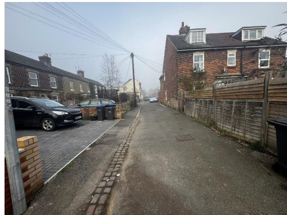
View from southern end of Longland