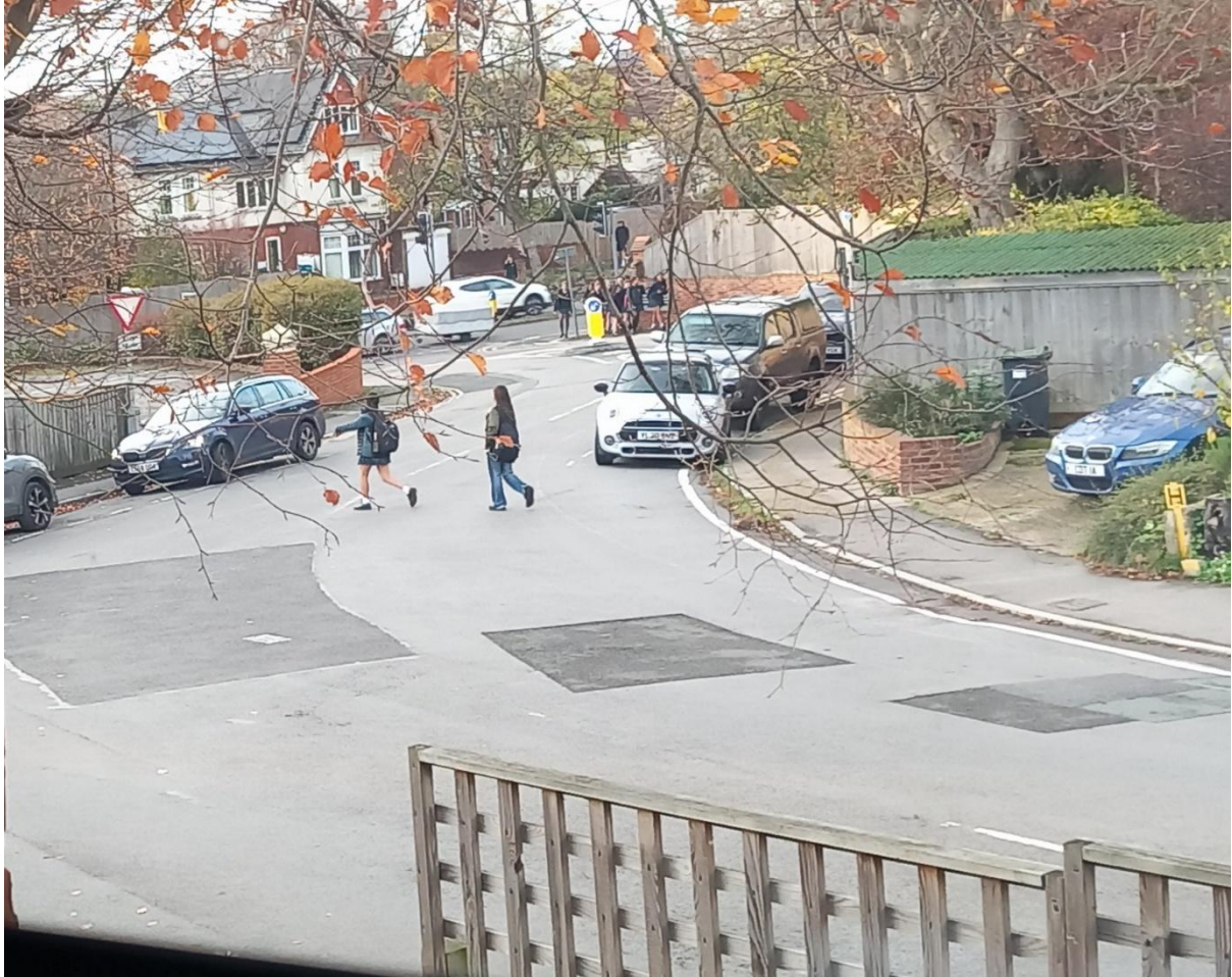
Children crossing to parent's car