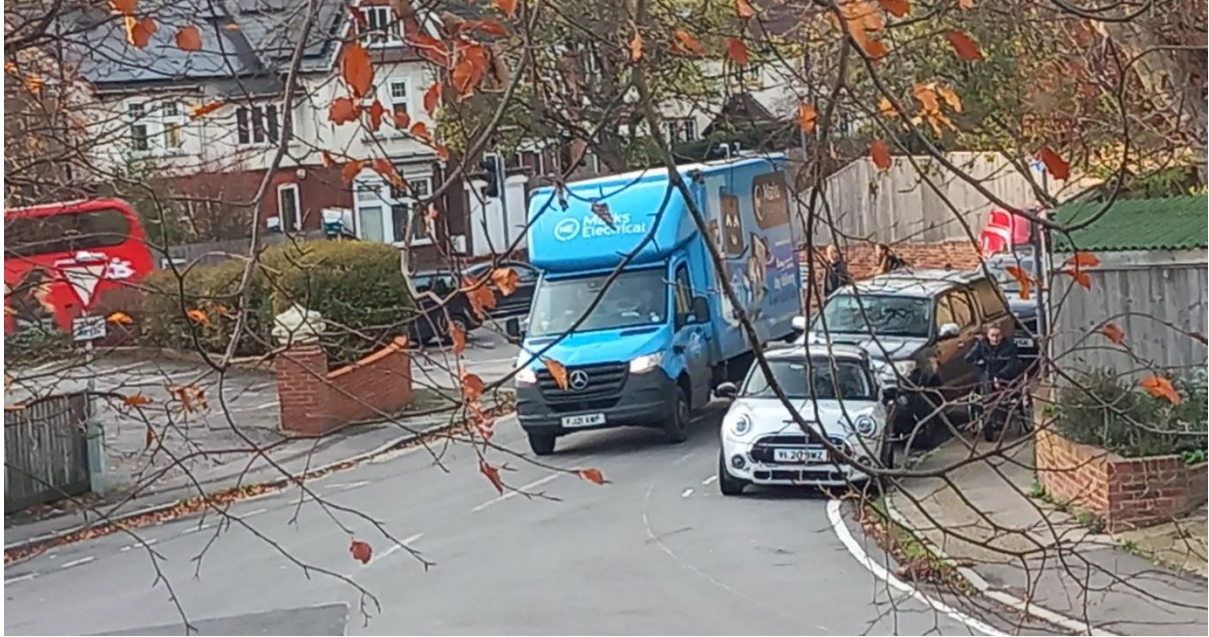
Van has to go over central line on blind bend due to parking bays