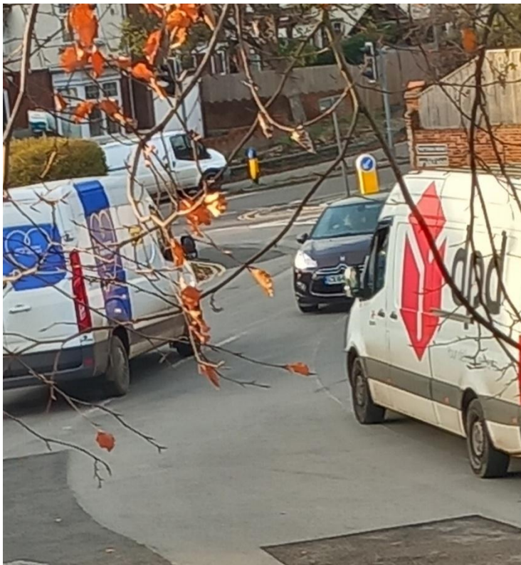
The effect on traffic on bend due to blind corner