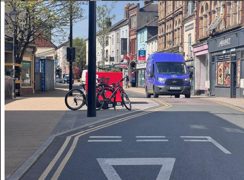
View without the parked van