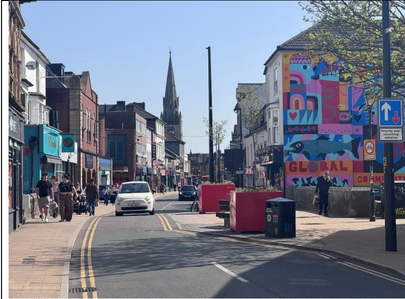
View of the Pinch-Point when heading into town.